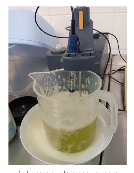
Laboratory pH measurement